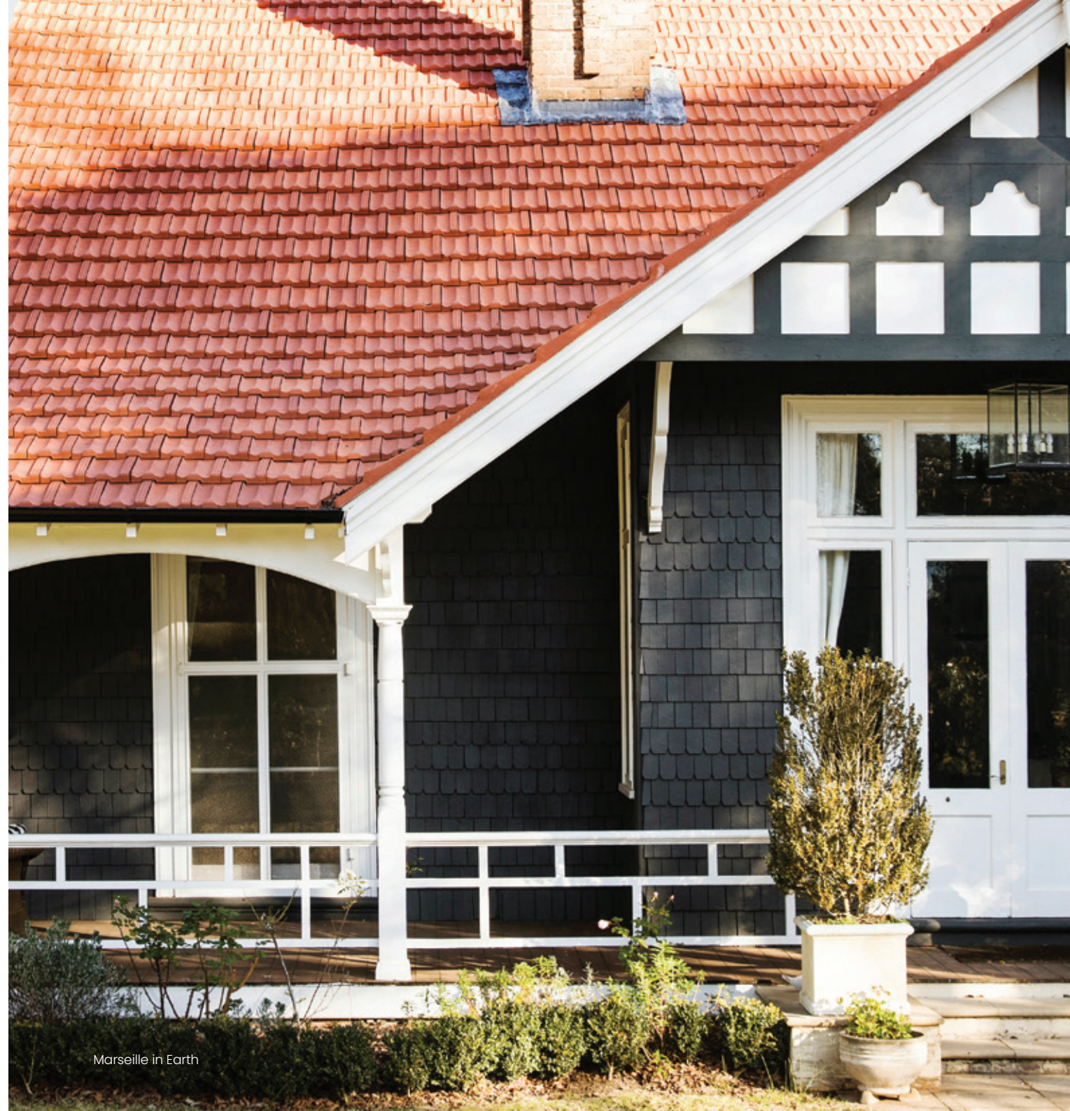
Marseille in Earth

Tile colour may vary from printed brochure.